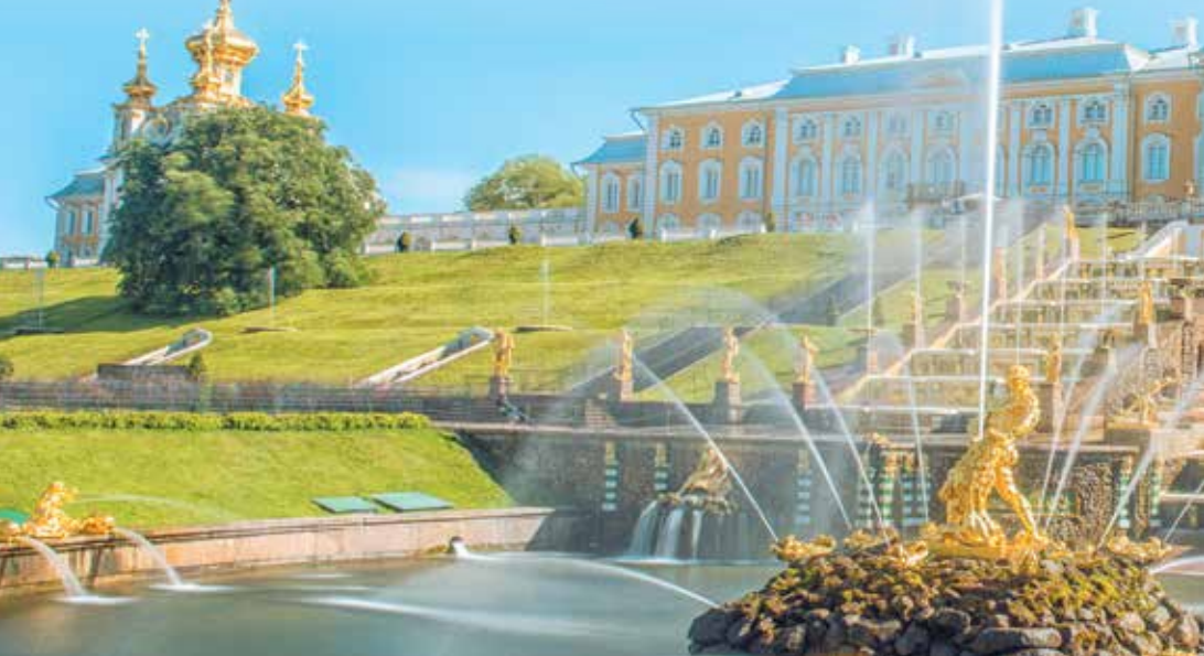
Photo this page: Peter the Great himself partially engineered the resplendent plexus of waterfalls, fountains and statues that adorns the foreground of the opulent Grand Palace at Petrodvorets.

Cover photo: Spanning 14 small islands, where shimmering Lake Mälaren meets one of the largest archipelagos in the Baltic Sea, Stockholm balances medieval and Renaissance architecture with modern urban design.