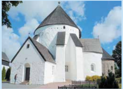
Oesterlars Church is the largest "round church" on Bornholm Island, Denmark.

where legendary landmarks are scattered across more than 100 islands linked by more than three times as many bridges. St. Petersburg's main thoroughfare, Nevsky Prospekt, showcases exquisite examples of Russian Baroque and neoclassical architecture. See the ornate Church of Our Savior on Spilled Blood (Church of the Resurrection of Christ), built on the site of Emperor Alexander II's assassination, and the 19 th -century St. Isaac's Cathedral, with a striking golden dome that is one of the glories of the city's skyline. Visit St. Petersburg's first building, the Peter and Paul Fortress, constructed to secure the country's access to the sea, and the impressive Baroque Cathedral of