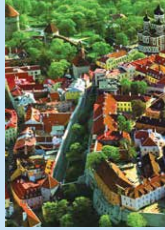
Tallinn, a hub of culture and commerce, is home to the 600-year-old spires and gables of the Old Town.

Catherine the Great. Its spectacular collections are rivaled only by its lavish interior.