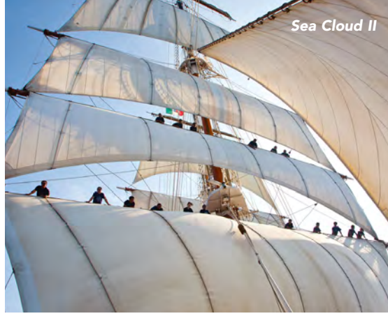
Sea Cloud II

of Erice. Alternatively, drive to the village of Mazara del Vallo to see its spectacular seven-foot bronze statue, retrieved from the sea by local fishermen. With his flying hair and goat ears, the 2,400-year-old figure was dubbed the Dancing Satyr . B,L,D