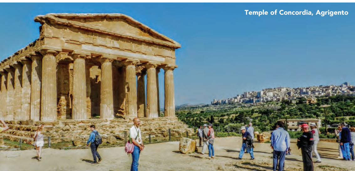
Temple of Concordia, Agrigento

DISCLAIMER: The itinerary is subject to change at the discretion of Arrangements Abroad. For complete details, please carefully read the terms and conditions at http://www.arrangementsabroad.com/terms