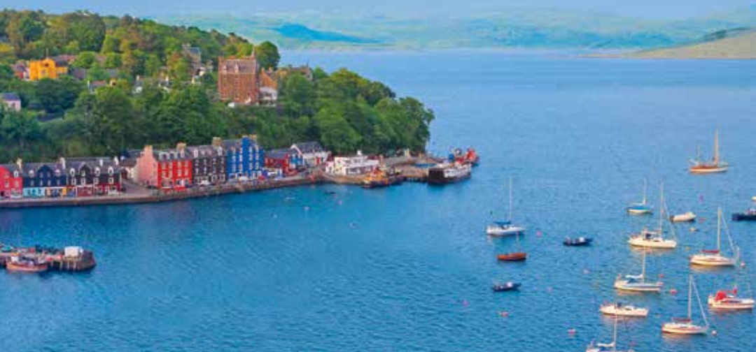
the sheltered sound in the colorful fishing port of Tobermory.

Stroll through the serene, restored abbey and see the churchyard's intricate Celtic crosses.