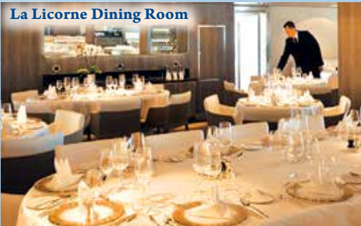
La Licorne Dining Room