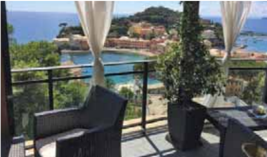
View from Hotel Vis à Vis