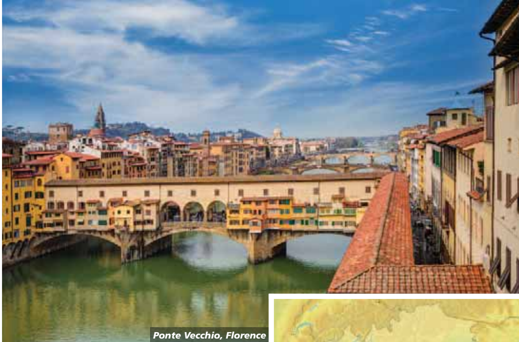
Ponte Vecchio, Florence