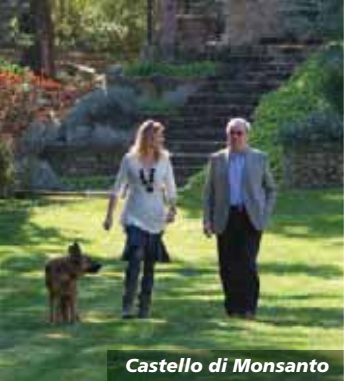
Castello di Monsanto