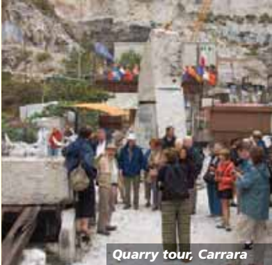
Quarry tour, Carrara