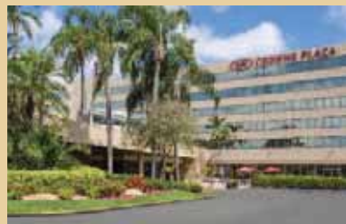
CROWNE PLAZA MIAMI INTERNATIONAL | MIAMI