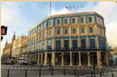
HOTEL TELÉGRAFO | HAVANA

Our travel experts have selected these first-class properties, each in a prime location, for your comfort. Details in the design and décor celebrate the local culture and enhance the ambience of each hotel. Of utmost importance is the superior quality of the services, amenities and accommodations, allowing you to maximize the enjoyment of your stay.