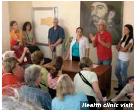
Health clinic visit