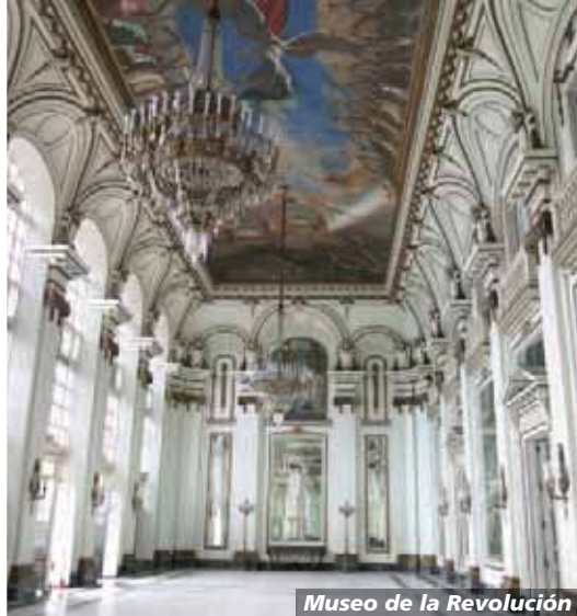
Museo de la Revolución