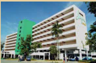
HOTEL JAGUA | CIENFUEGOS