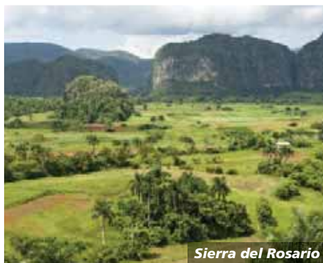
Sierra del Rosario