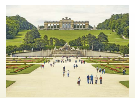
Palace and Gardens of Schönbrunn

Enjoy a morning cruising the Main River.