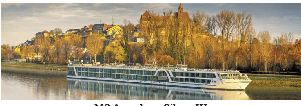
MS Amadeus Silver III

The Amadeus fleet of fine river ships has defined the art of cruising on the great rivers of Europe. As you board the Amadeus Silver III, you'll sense an ambience evocative of a grand European hotel. This magnificent ship, with 84 staterooms and suites, offers exemplary service, comfort and safety. Travelers can relax on the River Terrace or unwind with a workout or a massage. Savor European specialties at breakfast and lunch buffets and a selection of regional dishes at dinner, plus enjoy a choice of beer, wine or soft drinks at lunch and dinner. All staterooms and suites face outward so you can appreciate the views from the privacy of your cabin. Wi-Fi is complimentary.