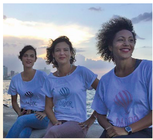
Founders and owners of Dador

Later today, visit the Ludwig Foundation, a nonprofit cultural institution that is dedicated to protecting and promoting Cuban artists.