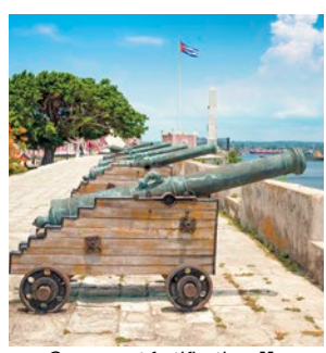
Cannons at fortification, Havana