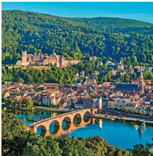
View of Heidelberg from Philosopher's Way