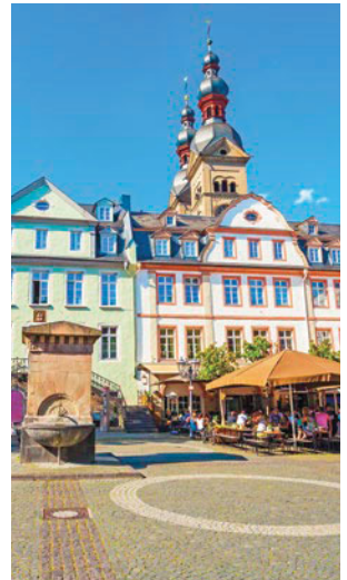
Market Square, Koblenz

Knowledgeable Lecturers deepen your appreciation for the region and its history, culture and current events.