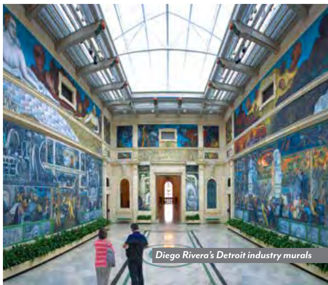
Diego Rivera's Detroit industry murals

This morning, transit the Soo Locks from Lake Huron to Lake Superior and back. Arrive in Sault Ste. Marie and explore the SS VALLEY CAMP, a retired lake freighter that is now a museum featuring exhibits of faithfully restored