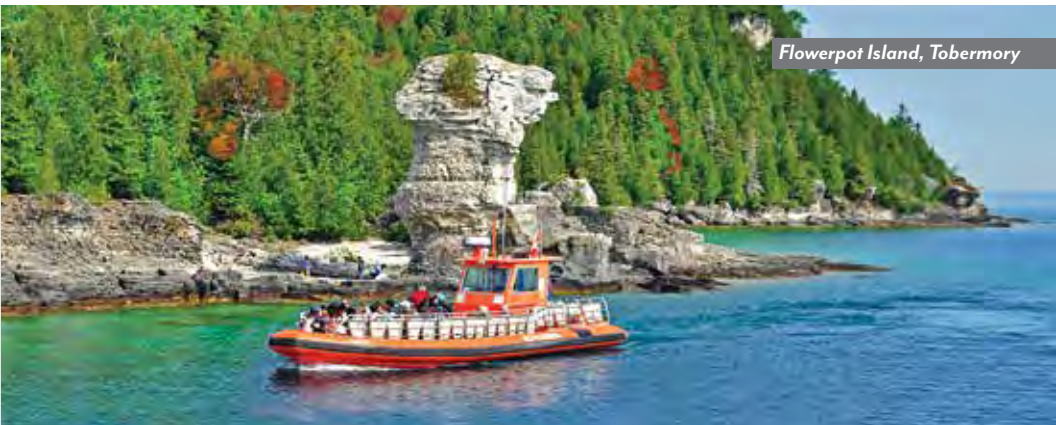
Flowerpot Island, Tobermory

Disembark continue on to the Milwaukee Post-Program Option or transfer to the airport for your return flight home.