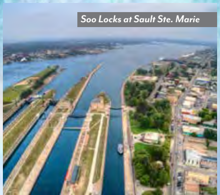
Soo Locks at Sault Ste. Marie

In the heart of North America lies the world's largest reservoir of fresh water, carved by glaciers 10,000 years ago. Surrounded by 11,000 miles of spectacularly sculpted shoreline, the five Great Lakes boast powerful natural wonders, historical maritime landmarks, and some of the greatest engineering feats of the 19 th century. Our tour offers a glimpse of life on the Great Lakes over the last two centuries as we visit the nearly 200-year-old Welland Canal that connects Lake Erie with Lake Ontario and the mighty Soo Locks—one located in Sault Ste. Marie in Ontario, Canada, and the other in a city by the same name in Michigan. Learn more about this fascinating maritime history at the SS VALLEY CAMP Museum, housed in a 1917 lake freighter, where two lifeboats from the famous EDMUND FITZGERALD shipwreck are on display.