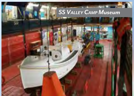
SS VALLEY CAMP Museum