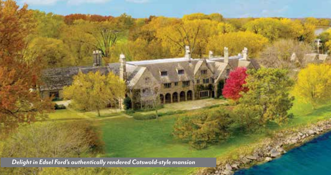
Delight in Edsel Ford's authentically rendered Cotswold-style mansion