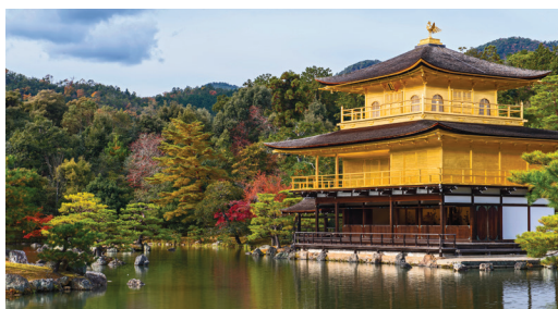
We visit Kyoto’s Temple of the Golden Pavilion on Day 10.

The Brown Travelers program strives to include a representative of Brown on each trip, and we will make every effort to provide an outstanding faculty lecturer for this departure. However, group travel is planned far in advance, and given the current very fluid nature of travel, we cannot guarantee confirmation of Brown faculty participation on this program. If for any reason we are unable to send an accompanying lecturer, please be assured that our tour operators all share our belief that travel should provide an opportunity to learn about the world in deep and meaningful ways, and the educational content of this tour remains very high.