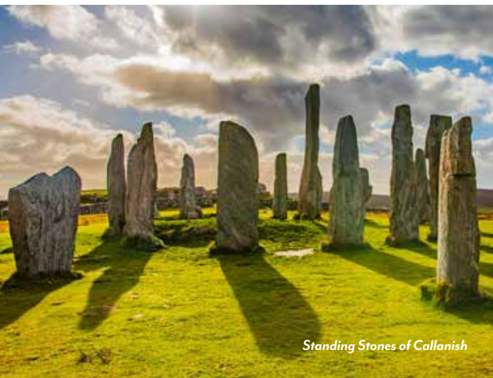
Standing Stones of Callanish