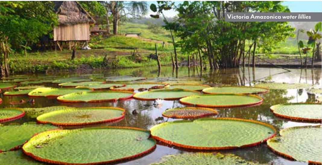
Victoria Amazonica water lilies