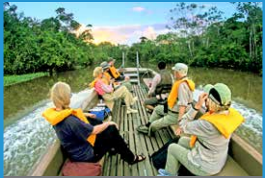
Small boat excursions