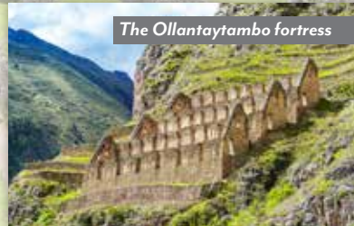
The Ollantaytambo fortress