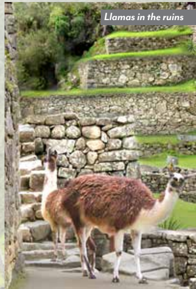
Llamas in the ruins

Cradled by the soaring peaks of the Andes Mountains, the Inca citadel of Machu Picchu evokes awe and wonder like few places on Earth. Our itinerary includes an extraordinary opportunity to experience the majesty of this “lost city of the Incas” and other treasures of the lush Sacred Valley. Built in the 15 th century as a summer retreat for the Inca emperor Pachacuti, Machu Picchu was unknown to the outside world for four centuries until American explorer Hiram Bingham III discovered it in 1911. A century of extensive research and study still has not revealed the secrets of its purpose, its residents, or its abandonment; nevertheless, this UNESCO World Heritage Site has been carefully excavated and preserved. Our exploration of the Sacred Valley’s ancient engineering marvels also includes a visit to the fortress of Ollantaytambo, which stands as a lasting testimony to the powerful and far-reaching Inca Empire. Here, village craftsmen employ age-old techniques to weave intricate tapestries and sculpt colorful pottery. You will also discover the Inca stone fortress of Sacsayhuamán in the Inca capital of Cuzco and see the UNESCO-designated city’s grand Baroque- and Renaissance-style churches—a fascinating mix of pre-Columbian and colonial influences.