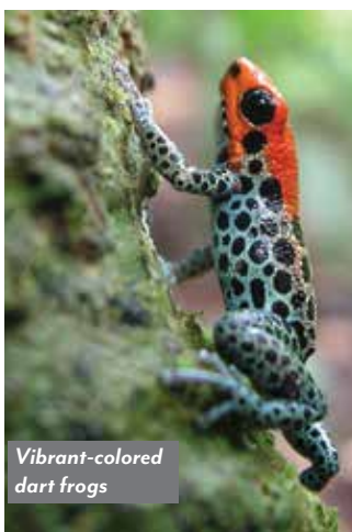
Vibrant-colored dart frogs