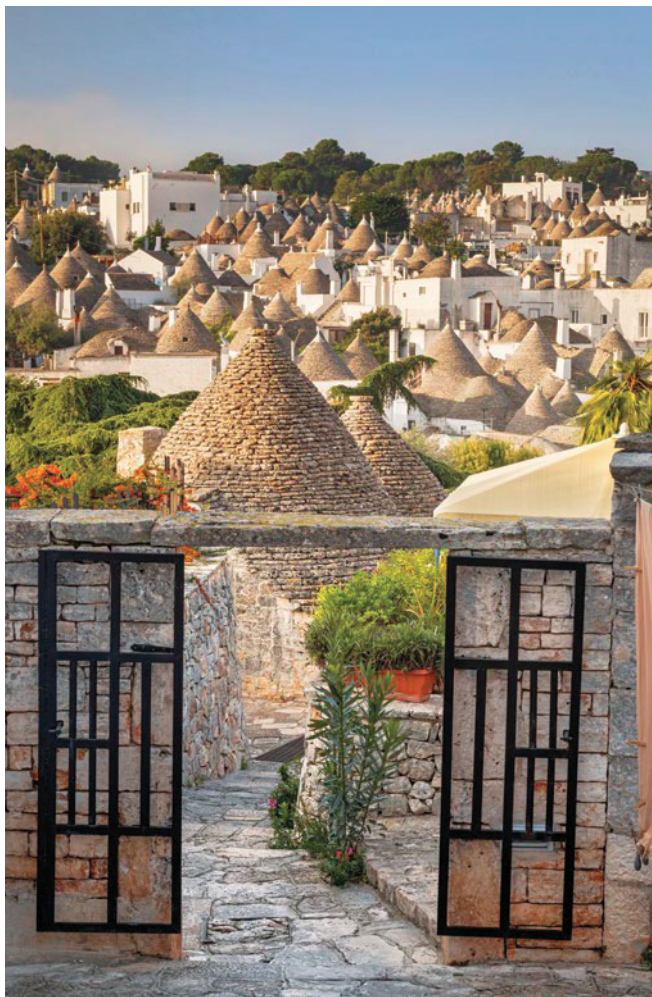
Trulli of Alberobello