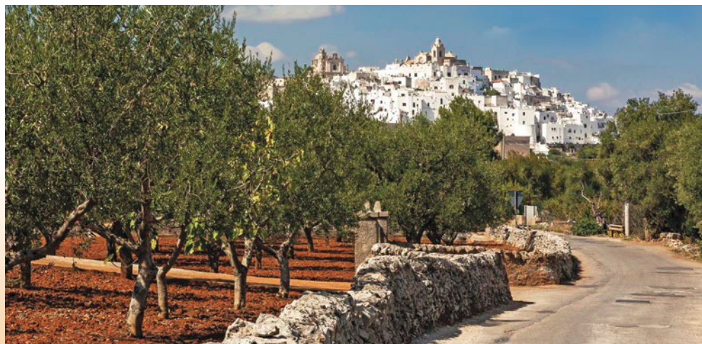
Ostuni, "The White City"

AHI Connects | Olive Mill Outing. Visit a family-run olive mill in the sun-baked countryside. Learn about the history and cultivation process of olives. Unwind over lunch and gather with the mill's employees or owners to discuss life in Italy.