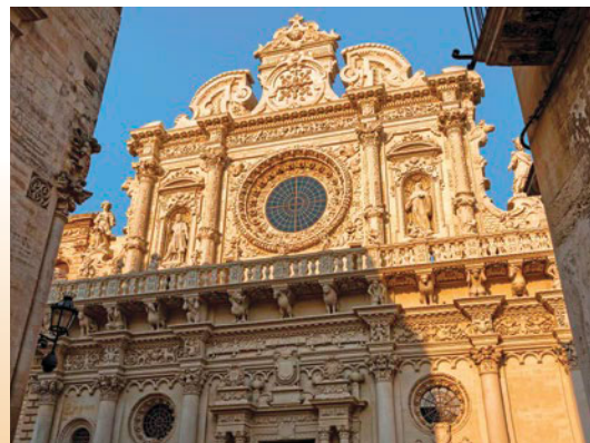
Basilica di Santa Croce, Lecce

Enrichment: History & Architecture of Lecce & Ostuni. Learn about this region's fascinating history and unique architectural styles.