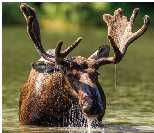
A bull moose enjoys a dip.

Day 11: Banff/Depart for U.S We transfer this morning to the Calgary airport for our flights home. B