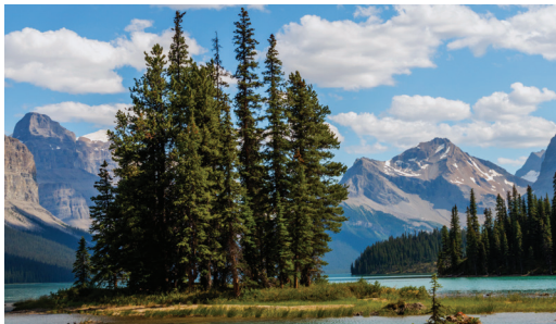
Maligne Lake and Spirit Island, Jasper National Park.

The Brown Travelers program strives to include a representative of Brown on each trip, and we will make every effort to provide an outstanding faculty lecturer for this departure. However, group travel is planned far in advance, and given the current very fluid nature of travel, we cannot guarantee confirmation of Brown faculty participation on this program. If for any reason we are unable to send an accompanying lecturer, please be assured that our tour operators all share our belief that travel should provide an opportunity to learn about the world in deep and meaningful ways, and the educational content of this tour remains very high.