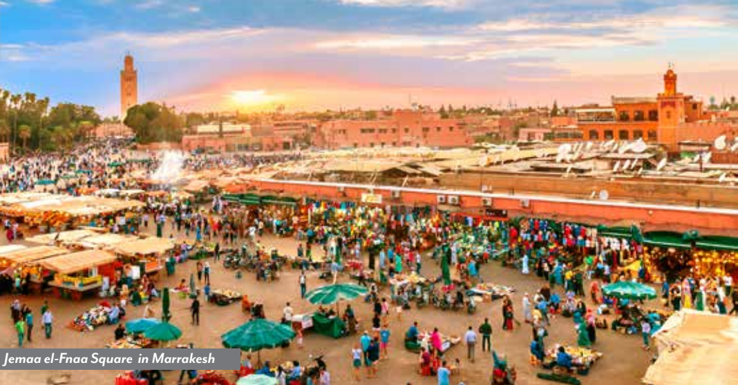
Jemaa el-Fnaa Square in Marrakesh