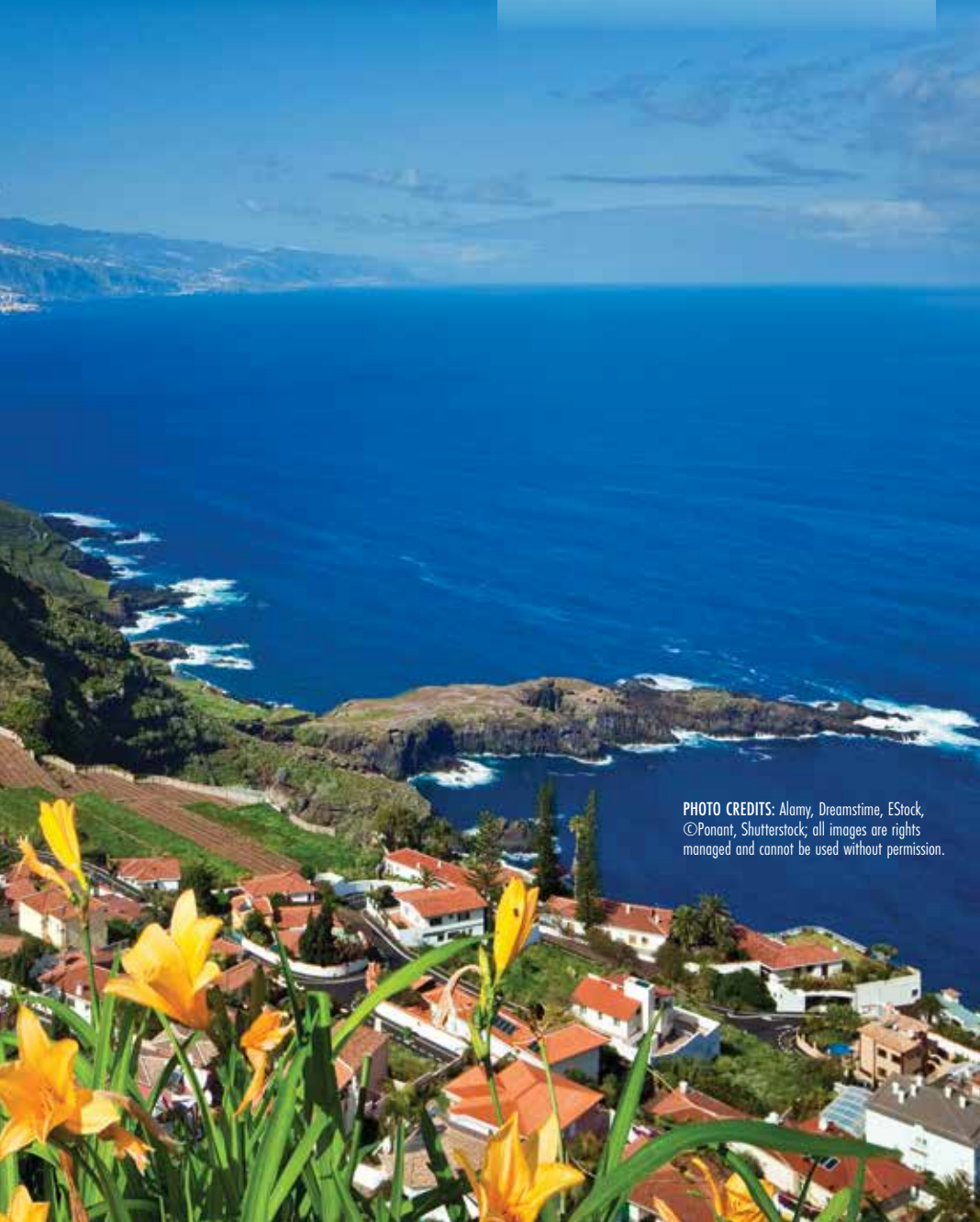
PHOTO CREDITS: Alamy, Dreamstime, EStock, ©Ponant, Shutterstock; all images are rights managed and cannot be used without permission.