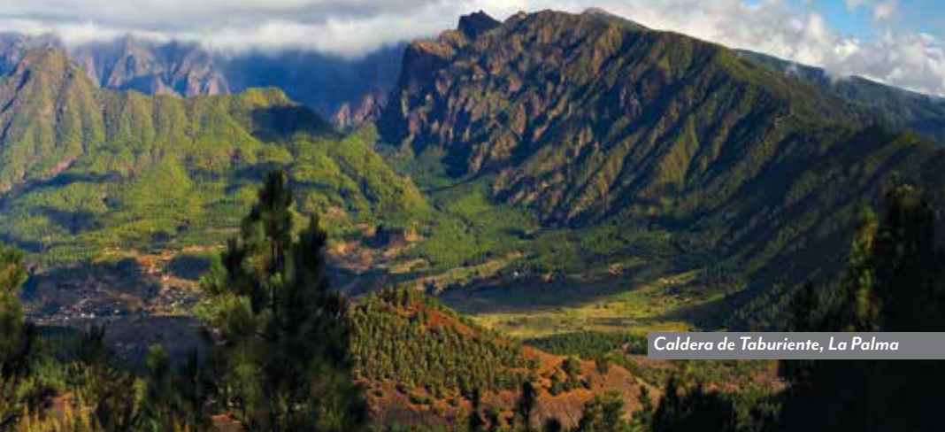
Caldera de Taburiente, La Palma