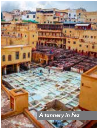
A tannery in Fez

Enjoy an afternoon at leisure to experience the captivating