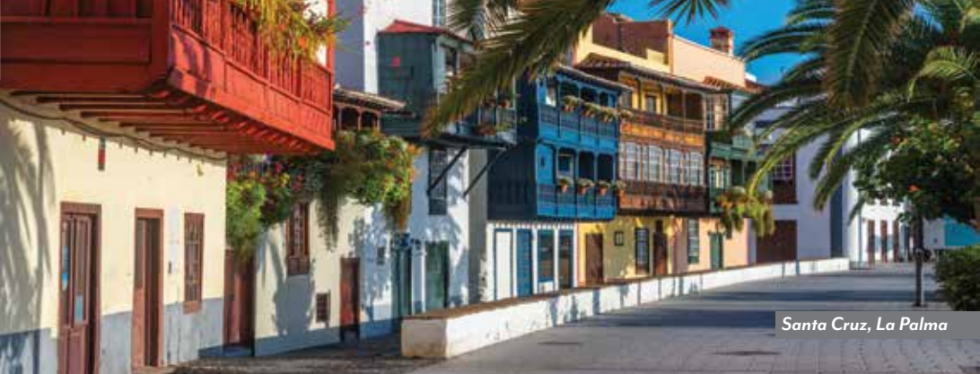
Santa Cruz, La Palma