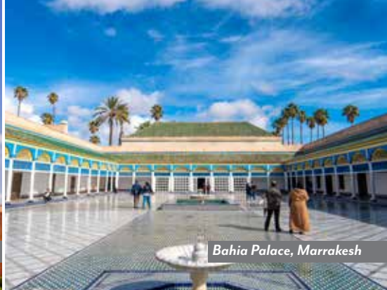
Bahia Palace, Marrakesh

sights and sounds evocative of Humphrey Bogart and Ingrid Bergman's Casablanca . Attend the Captain's Farewell Reception on board this evening.