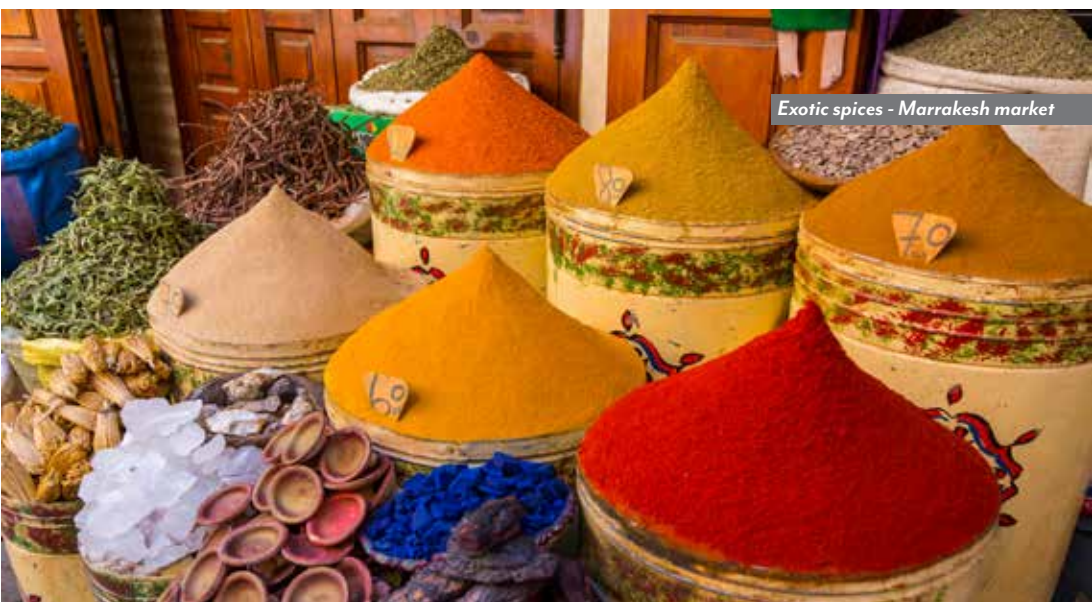
Exotic spices - Marrakesh market