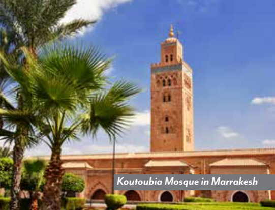
Koutoubia Mosque in Marrakesh