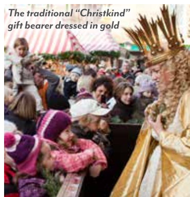
The traditional “Christkind” gift bearer dressed in gold

The concept of an open-air fair in December dates to 13th century Vienna, when Duke Albrecht I granted permission for a market that would allow townspeople to gather supplies for the winter ahead. While historians say there is no evidence that this medieval market had any connection to religion, the popularity of the wintermärkte spread through German-speaking regions during the Middle Ages. By the 16th and 17th centuries, as festive Christmas celebrations became popular in Austria and Germany, the winter market evolved into the more elaborate spectacle now known as the Christkindlmärkte —which translates to “Christ child market.” The market stalls began filling up with delectable treats and hand-crafted Christmas nutcrackers, wood carvings, and other ornaments. Nuremberg’s lavish Christkindlesmarkt , which you will visit on our tour, has been operating since at least 1628. In addition to Old World Christmas decorations, the market is renowned for preserving the city’s famous rostbratwurst and the 17th century lebkuchen gingerbread. Today, these centuries-old traditions continue through Europe with sparkling lights, boughs of fresh pine, roasted chestnuts, mugs of glühwein , and the sound of Christmas carols filling the air.