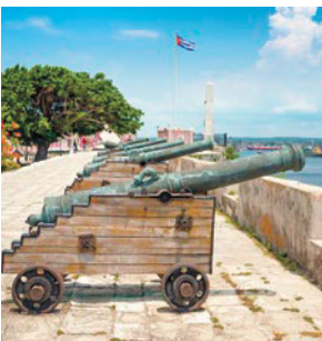
Cannons at fortification, Havana