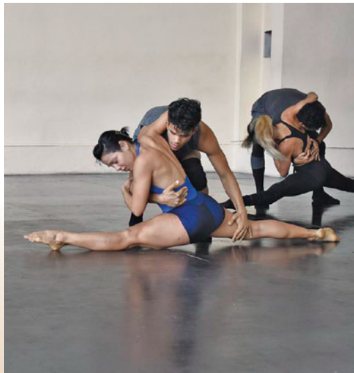
Contemporary Cuban dancers