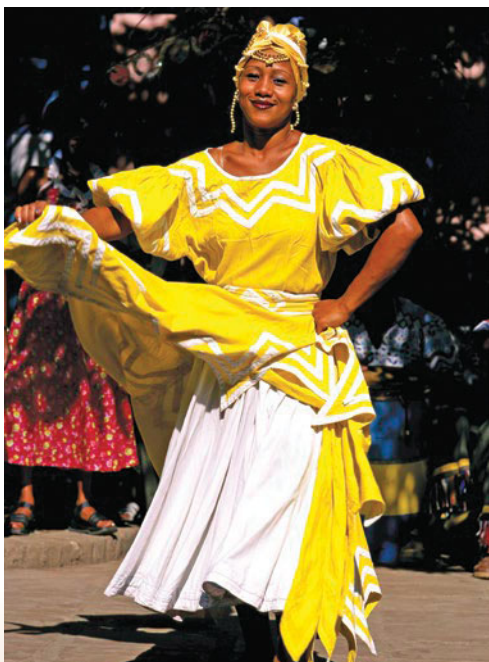
Top: Vintage automobiles, Havana Cover: Cuban jazz musician Mail panel: Old Havana | Afro-Cuban musician