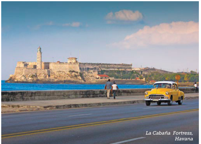
La Cabaña Fortress, Havana