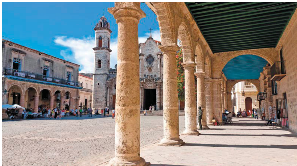
Plaza of the Cathedral, Old Havana