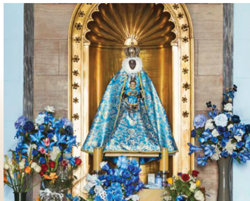
Black Madonna, Iglesia de Nuestra Señora de Regla

After lunch in Matanzas, visit the Sugar Mill Triunvirato to see the moving, 19th-century Monument to the Slaves' Rebellion.