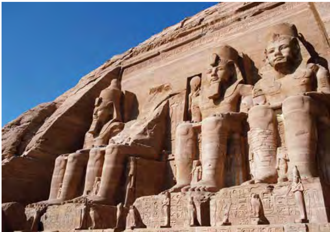
The magnificent temples at Abu Simbel commemorate Ramses II and his queen, Nefertari.