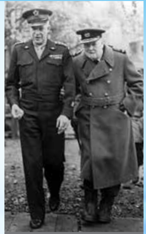
President Dwight D. Eisenhower with Winston Churchill