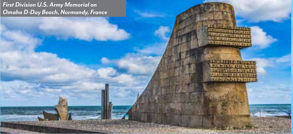
First Division U.S. Army Memorial on Omaha D-Day Beach, Normandy, France