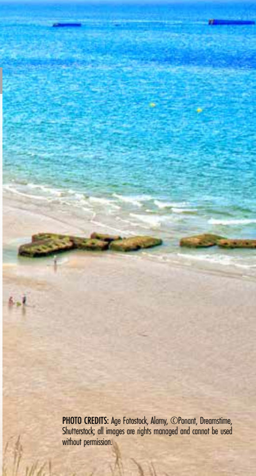
PHOTO CREDITS: Age Fotostock, Alamy, ©Panant, Dreamstime, Shutterstock; all images are rights managed and cannot be used without permission.