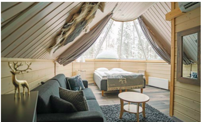
Northern Lights Village | Saariselkä