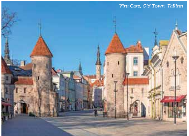
Viru Gate, Old Town, Tallinn