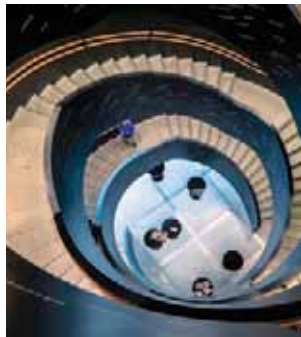
Oodi Library, Helsinki