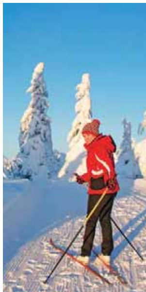
Exploring at Northern Lights Village