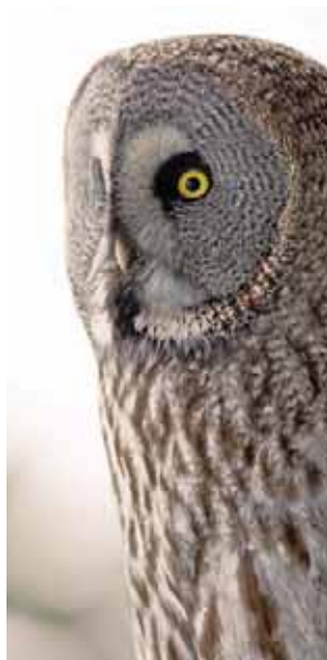
Great Grey Owl, Lapland