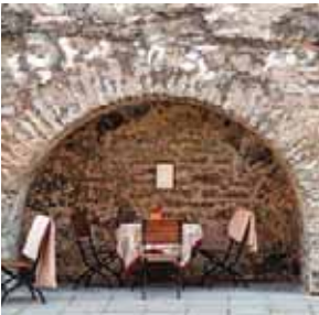
Old Town, Tallinn

Historic Center (Old Town) of Tallinn, Estonia