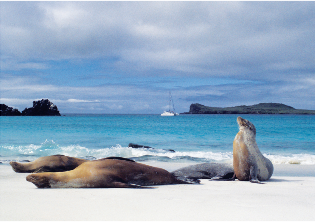
We encounter plenty of wildlife, like these sunbathing sea lions, in the Galapagos.

the Americas and the continent’s oldest continuously inhabited city. This morning we tour this UNESCO site and then stop at the ruins of Sacsayhuaman fortress, a masterpiece of Incan architecture. We enjoy lunch today at a local restaurant. B,L