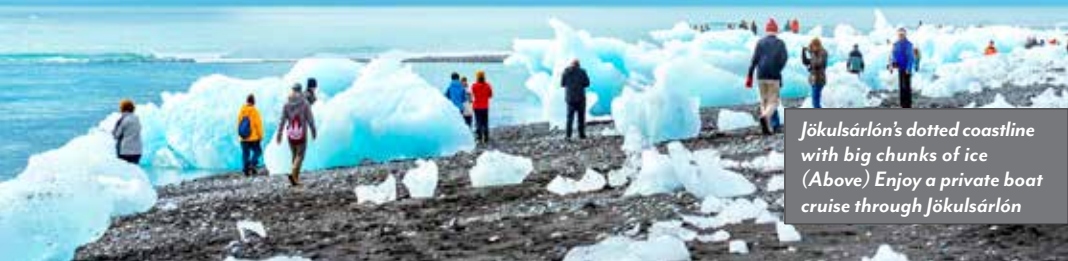
Jökulsárlón's dotted coastline with big chunks of ice (Above) Enjoy a private boat cruise through Jökulsárlón