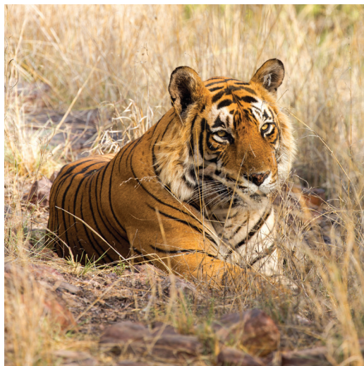
Bengal tiger rests in Ranthambore.

Day 19: Return to U.S. Very early this morning we transfer to the airport for our return flight to the U.S.