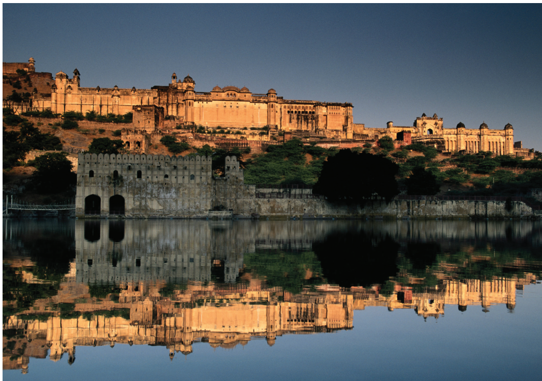
Visit Amber Fort, a UNESCO World Heritage site.

Day 8: Jaipur Our first stop is the stunning Hawa Mahal, the elaborately carved pink sandstone “Palace of the Winds.” We continue on to Amber Fort, built by the Kachhawah Rajputs as their capital from 1037 to 1728; Jantar Mantar, the open-air observatory; and City Palace Museum, housing the magnificent art collections of the Maharajahs of Jaipur. B,L