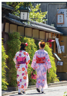
Geishas in traditional dress.

Day 11: Kyoto More of Kyoto is on tap today, beginning with a visit to the otherworldly Arashiyama Bamboo Grove; the Kyoto Museum of Traditional Crafts (Fureaikan), showcasing all of Kyoto’s 74 different métiers in one place; and Nijo-jo Castle (c. 1603), the extravagant residence and fortifications of the shoguns who ruled Japan for more than 250 years. Then the remainder of the day is free for independent exploration in this traditional yet modern city. B