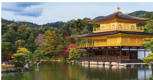
We visit Kyoto’s Temple of the Golden Pavilion on Day 10.

The Brown Travelers program aims to include a representative from Brown on each trip, and we make every effort to secure an outstanding faculty lecturer for the departure. However, due to the advanced planning required for group travel and the current dynamic nature of travel arrangements, we may encounter challenges in confirming Brown faculty participation for this specific program. If, for any reason, we are unable to arrange for an accompanying lecturer, please rest assured that our tour operators share our belief in the transformative power of travel as a profound learning opportunity. Despite potential variations in staffing, the educational content of this tour will be maintained at a high standard.