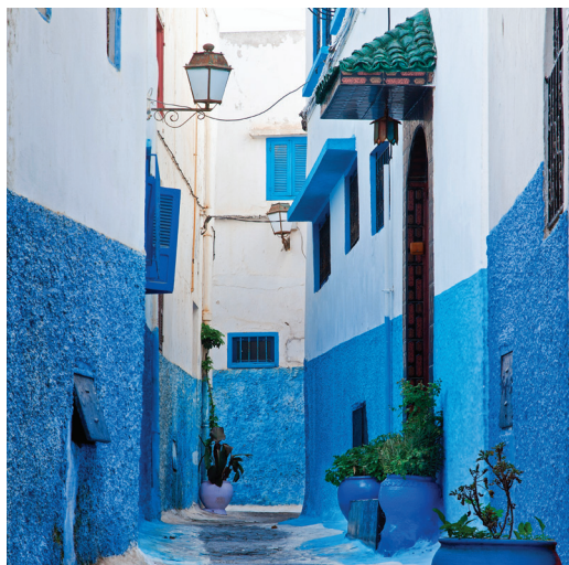
Rabat’s Kasbah des Oudaias.

Day 14: Depart for U.S. After breakfast this morning we transfer to the airport for our return flight to the U.S. B