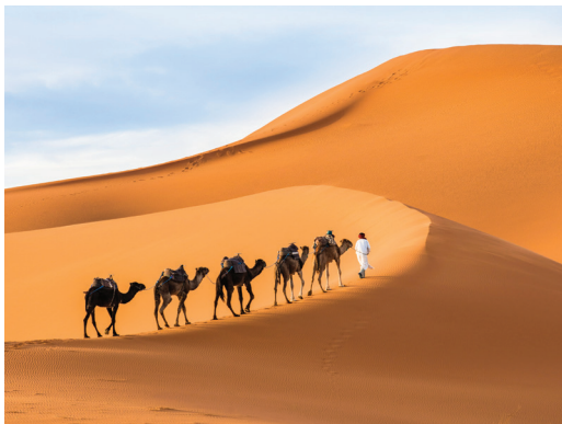
We ride camels in the Sahara.

The Brown Travelers program strives to include a representative of Brown on each trip, and we will make every effort to provide an outstanding faculty lecturer for this departure. However, group travel is planned far in advance, and given the current very fluid nature of travel, we cannot guarantee confirmation of Brown faculty participation on this program. If for any reason we are unable to send an accompanying lecturer, please be assured that our tour operators all share our belief that travel should provide an opportunity to learn about the world in deep and meaningful ways, and the educational content of this tour remains very high.