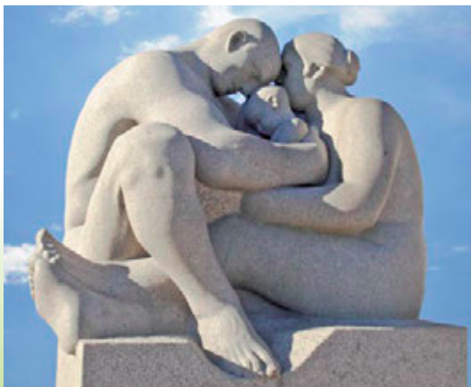
Vigeland Park, Oslo

Norwegian painter Edvard Munch was one of the most influential figures of the Modernist movement. At the new MUNCH Museum, view his celebrated masterpiece, "The Scream," and other works from his prolific, 60-year career. Afterward, delve into the amazing voyages of the great Norwegian explorer Thor Heyerdahl at the Kon-Tiki Museum. Study his famous vessels, the balsawood raft Kon-Tiki and the totora-reed boat Ra II, which he used to cross