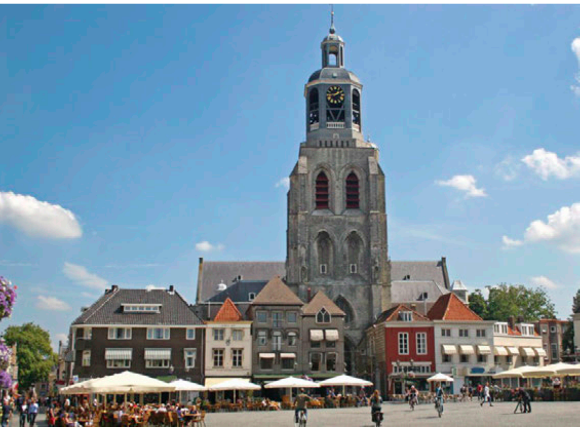
Central square, Bergen

the Atlantic in 1970. Then it's time to head to the water yourself for a panoramic cruise on Oslofjord!