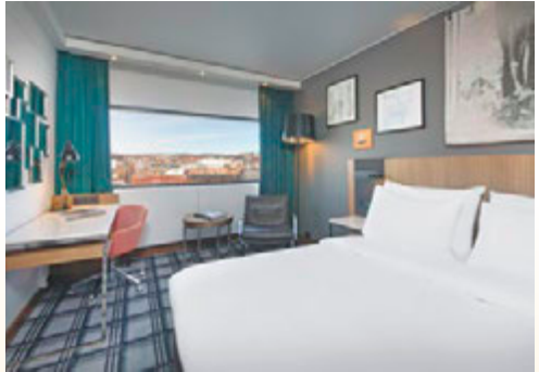
Radisson Blu Scandinavia Hotel | Oslo