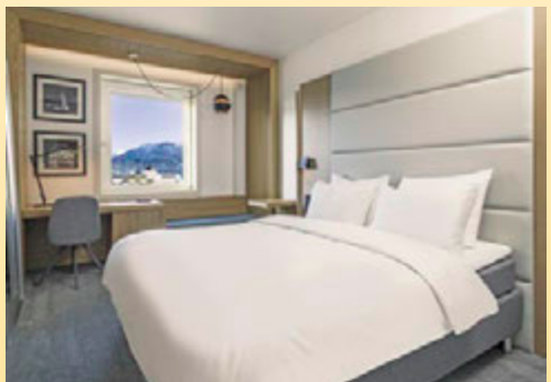
Radisson Blu Hotel | Tromsø