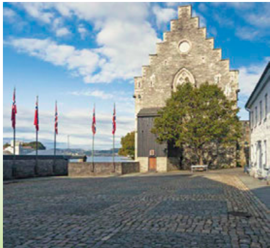
Håkon's Hall, Bergen