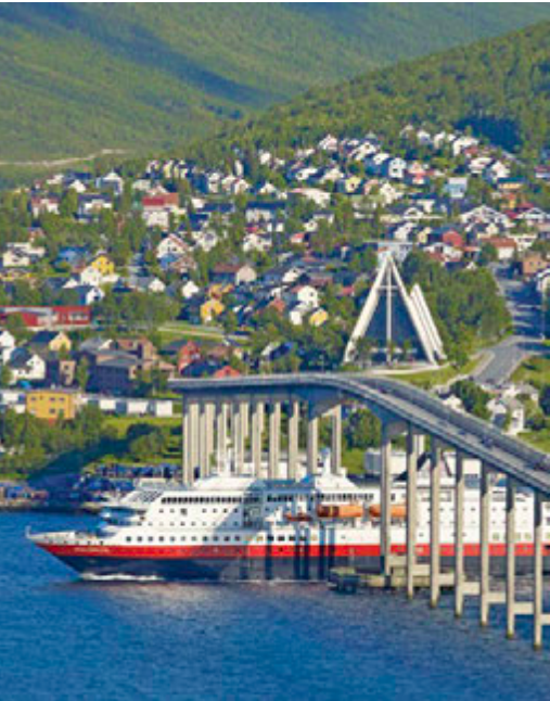
Arctic Cathedral and Tromsø Bridge, Tromsø

Discovery: Nature of Northern Norway. Find out more about arctic wildlife at Polaria, which features playful seals and an aquarium filled with northern species of fish. Then admire the gorgeous arctic and alpine flora that thrives in this northerly climate at a botanical garden.