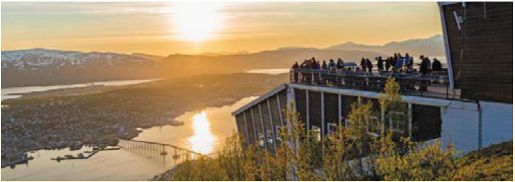
Cable car station, Tromsø