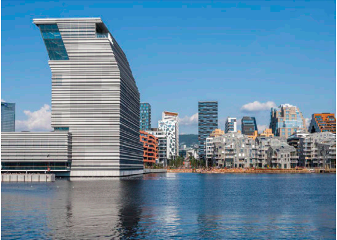
MUNCH Museum (left), Oslo