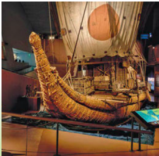
Kon-Tiki Museum, Oslo

Discovery: Bergen. Nestled by a sheltered harbor and surrounded by seven mountains, Bergen exudes a cozy charm. With your guide, explore the historic wharf, Bryggen, an important trading center for the medieval Hanseatic League.