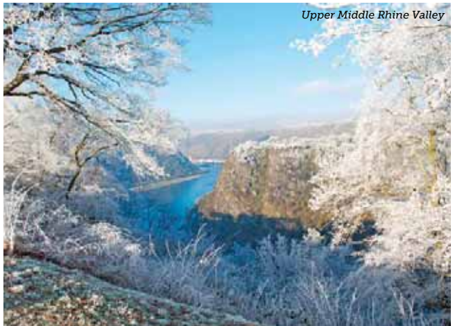
Upper Middle Rhine Valley