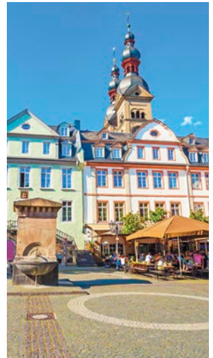
Market Square, Koblenz

Knowledgeable Lecturers deepen your appreciation for the region and its history, culture and current events.