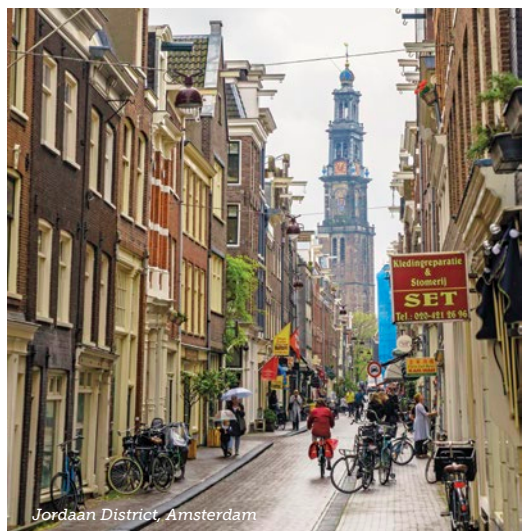
Jordaan District, Amsterdam

the history of this scrumptious treat, see the landmark chocolate fountain—at 3 meters high and filled with 400 pounds of warm, liquid chocolate—and enjoy a tasting.