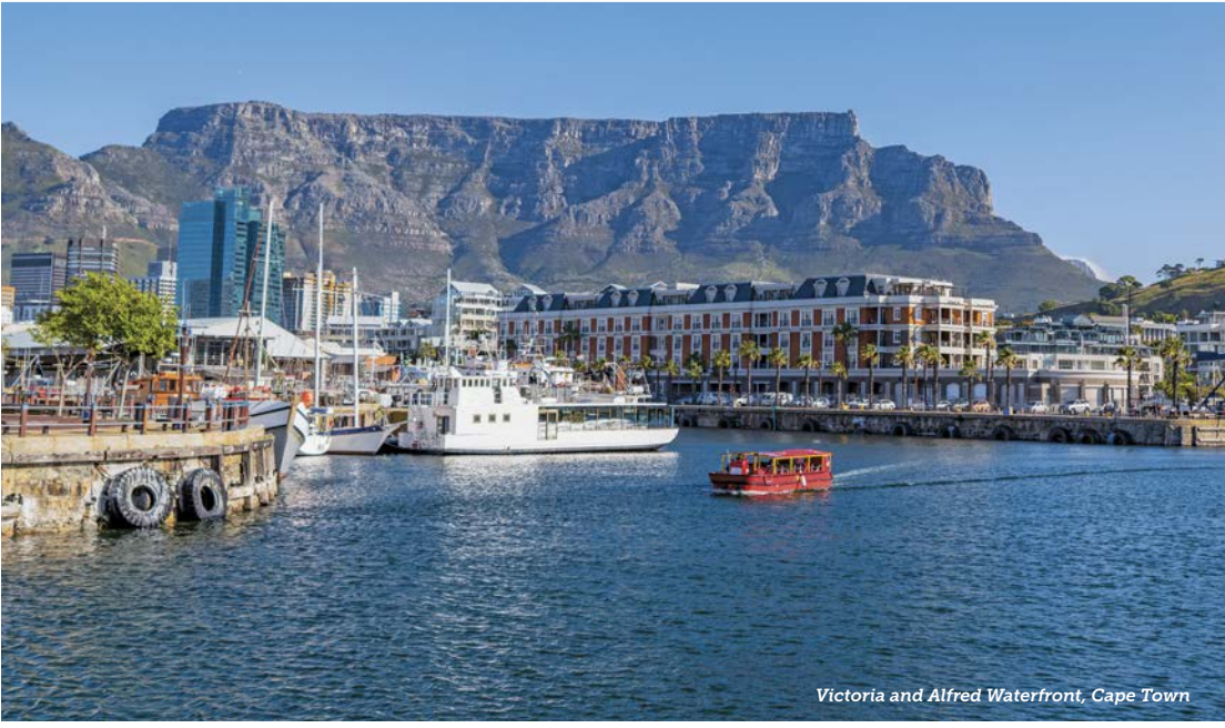
Victoria and Alfred Waterfront, Cape Town