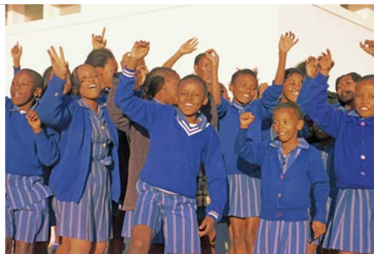
Soweto youth group