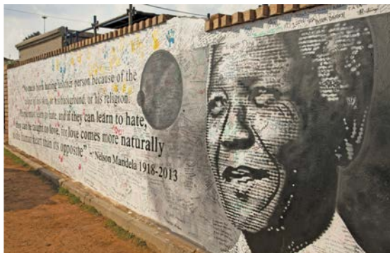
Nelson Mandela mural, Soweto

Note: Itinerary may change due to local conditions.