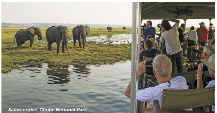
Safari cruise, Chobe National Park