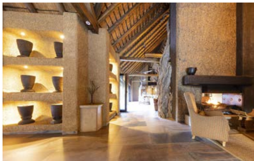
Kapama River Lodge | Kapama Private Game Reserve ●●●●●

Our travel experts have selected these luxury properties for your comfort. The hotels' prime locations put the cities at your doorstep, and the game lodges sit in the heart of game-rich parks, allowing you to immerse yourself fully in the safari experience. Details in the design and décor celebrate the local culture and enhance the ambience of each hotel and lodge. Their restaurants feature menus of elegantly prepared local and international cuisine. Of utmost importance is the superior quality of the services, amenities and accommodations, allowing you to maximize the enjoyment of your stay.