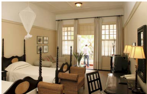
The Victoria Falls Hotel | Victoria Falls ●●●●●