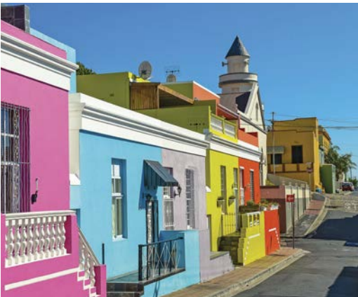
Colorful Bo-Kaap, Cape Town

Sheltered by Table Mountain, South Africa's Mother City is one of the world's most beautiful cities. Centuries-old Cape Dutch houses and colorful gardens dot the cityscape. A bustling waterfront welcomes visitors with inviting cafés and boutiques set amid workaday harbor life.