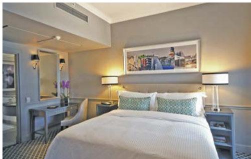
54 on Bath | Johannesburg ●●●●●