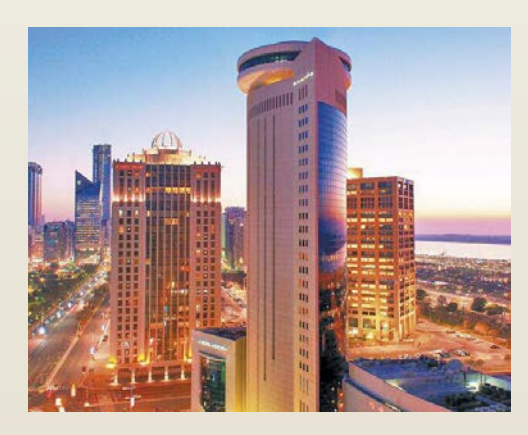
Le Royal Méridien Abu Dhabi | Abu Dhabi OOOOO