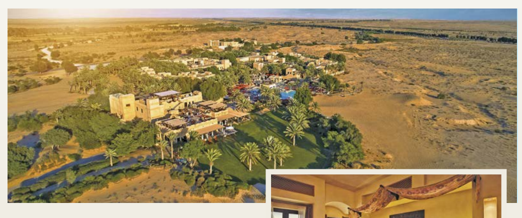
Al Wathba, a Luxury Collection Desert Resort & Spa | OOOOO