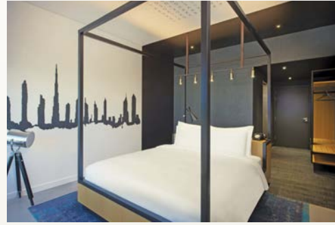
Canopy by Hilton Dubai Al Seef | Dubai