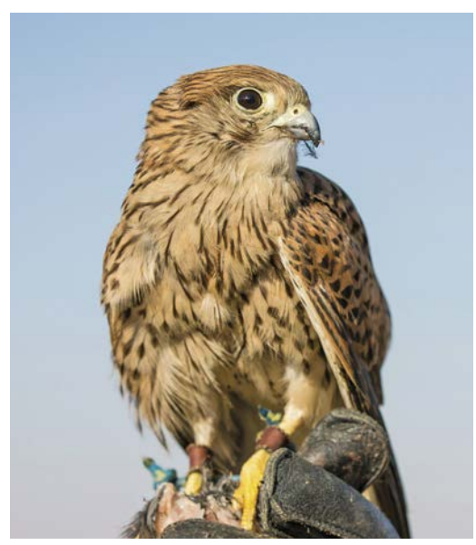
Falcon, UAE's national bird

Discovery: Abu Dhabi Falcon Hospital & Sheikh Zayed Grand Mosque. Falcons were used for centuries by the Bedouins for hunting in the desert and are revered throughout the Middle East for their beauty and speed. Learn more about these majestic creatures and see them up close