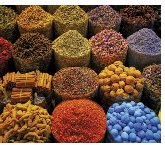
Spice Souk, Dubai

Discovery: Arabian Nights. Journey to a desert fortress tonight for a wonderful dinner beneath starry skies featuring delectable cuisine, live music and belly dancing.