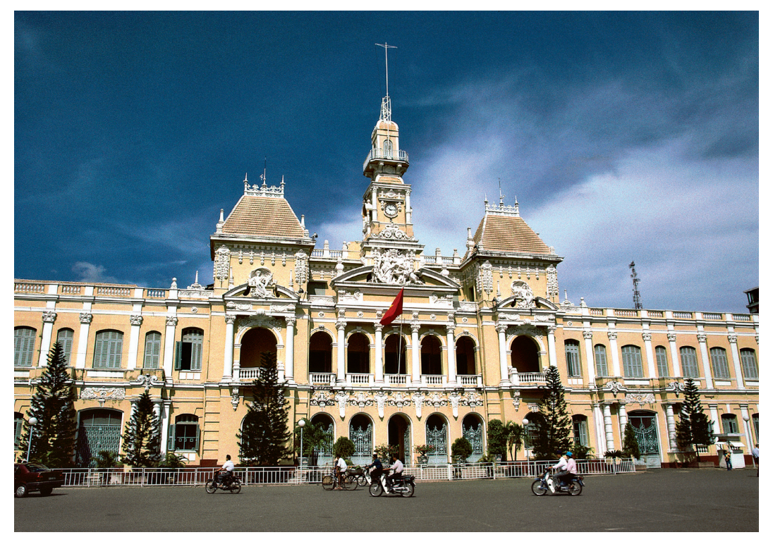
Observe the French architectural influences during a tour of Saigon on Day 13.

resort for a relaxing interlude. Tonight, we enjoy a cooking lesson and dinner in Hoi An. B,D