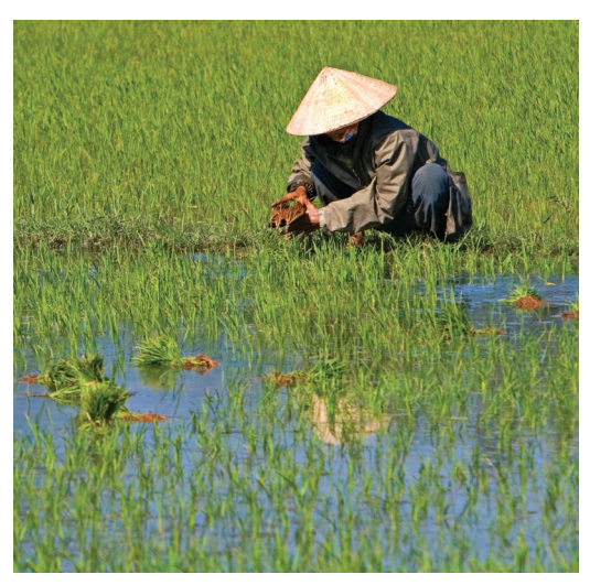
A local farmer tends a rice paddy.

Day 14: Saigon This morning we visit the Cu Chi Tunnels, the infamous underground network from