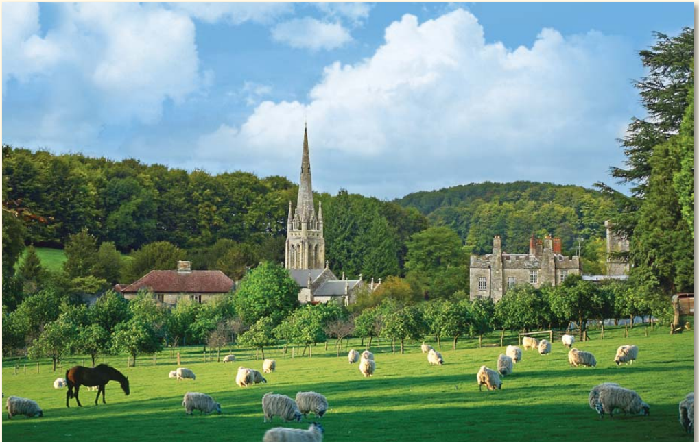
The long twilight glow of a perfect English summer evening sweeps over Chipping Campden, a serene, quintessential Cotswold village with a deep-rooted history in the wool trade.