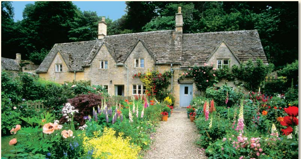
Romantic gardens and classic stone houses are just two English traditions that live on in the Cotswolds, a bastion of beauty, history and culture.

Stow-on-the-Wold is a delightful market town along the ancient Roman Fosse Way, the first great Roman road in Britain. This picturesque Cotswold town was designed around its market square during the height of the English wool industry with narrow-walled avenues, called tunes, to funnel up to 20,000 sheep to the market.