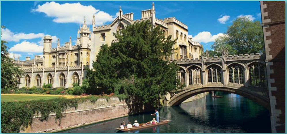
Punting along the serene River Cam is a long-standing tradition where students and locals enjoy a relaxing afternoon gliding through the heart of the beautiful and historic university town of Cambridge.