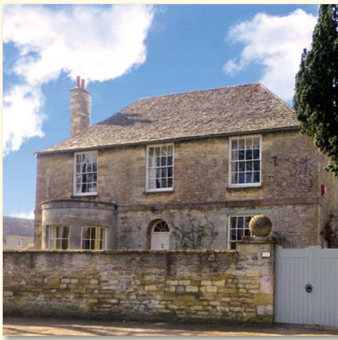
PBS's MASTERPIECE series Downton Abbey portrays Church Gate House as the home of Lady Crawley.

Chipping Campden is a prosperous medieval village with a picturesque 15 th -century Gothic parish church, 17 th -century almshouses and market hall, and wool-tycoon manors.