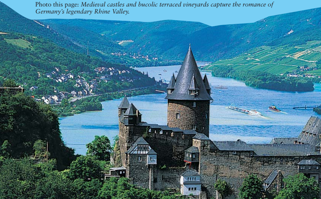
Photo this page: Medieval castles and bucolic terraced vineyards capture the romance of Germany's legendary Rhine Valley.

Cover photo: View the unforgettable peaks of the iconic Matterhorn from the top of the highest cog railway in Europe, the world-renowned Gornergrat Bahn.