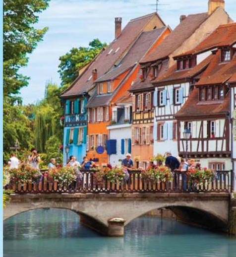
Half-timbered houses in Strasbourg's Petite-France quarter reflect the city's dual French and German character.

traveling from the snow-crowned heights of the Alps to subtropical lowlands. Admire the impressive natural treasures of soaring, snowcapped mountain peaks, green, rolling hills, crystal-clear glacial lakes and densely wooded forests.