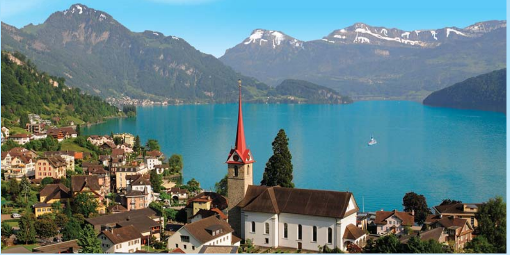
Cruise beautiful Lake Lucerne and enjoy picturesque views of its fjord-like landscape, Mounts Pilatus and Rigi in the distance and its four surrounding cantons of Lucerne, Schwyz, Unterwalden and Uri.

the famous Alte Brücke (Old Bridge) that span the Neckar River. Visit imposing Heidelberg Castle, a magnificent, 13 th -century edifice perched above the river. The stately ruins preserve Heidelberg's links to its medieval past.