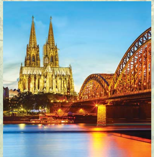
Towering spires crown Cologne's majestic Kölner Dom (cathedral), one of the finest Gothic structures ever built.

Following breakfast, disembark the ship and continue on the Amsterdam Post-Program or depart for the U.S.